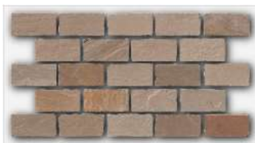
Premium Pathway Setts Autumn Blend