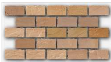
Premium Pathway Setts Buff Brown