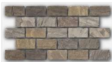
Premium Pathway Setts Monsoon