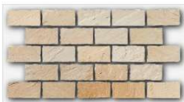
Premium Pathway Setts Mint