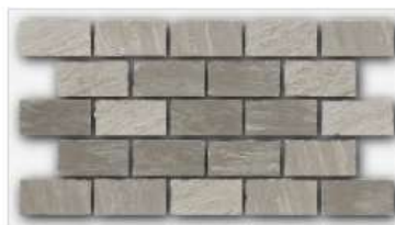
Premium Pathway Setts Castle Grey